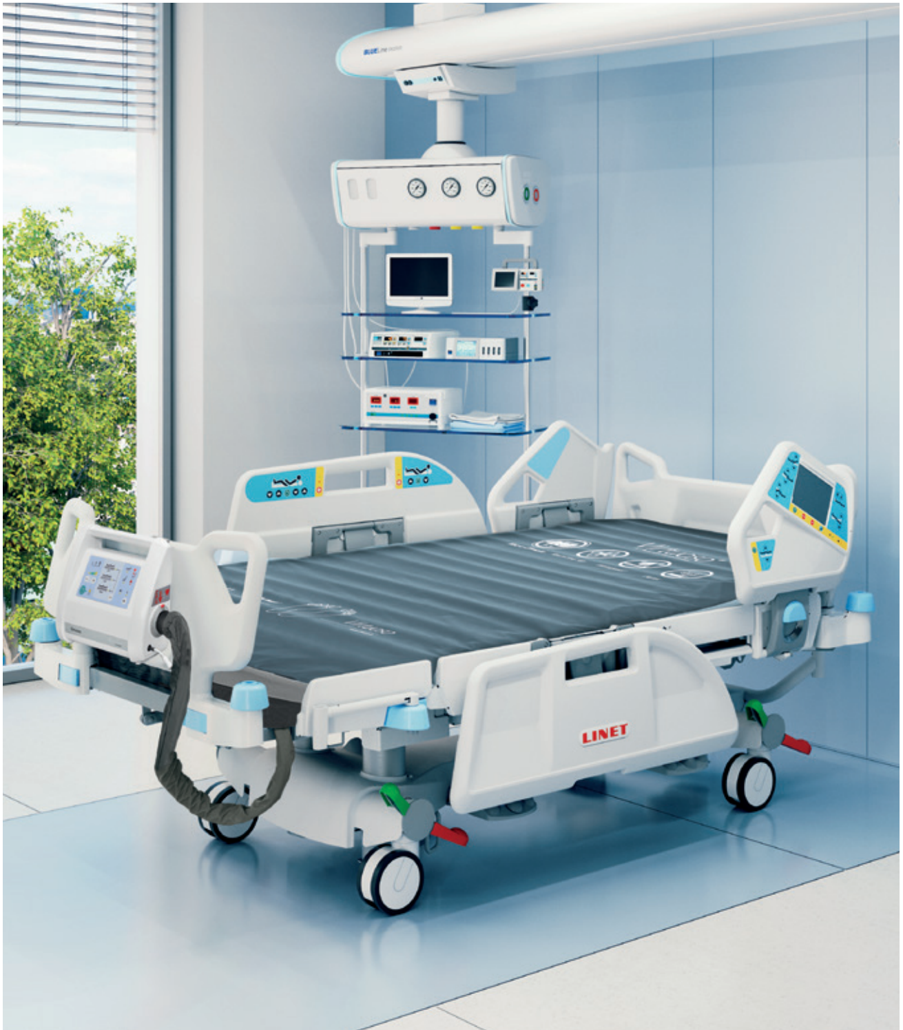
Critical Care Bed