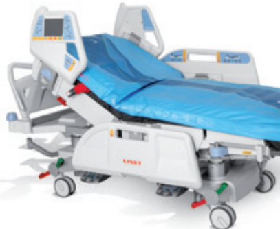
OptiCare® with integrated design.