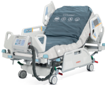
Virtuoso® with "Zero Pressure" and 3-cell technology.

The open architecture of the Multicare® bed allows for use of various mattress systems for prevention and as a treatment support of pressure injuries according to the needs of the patient.