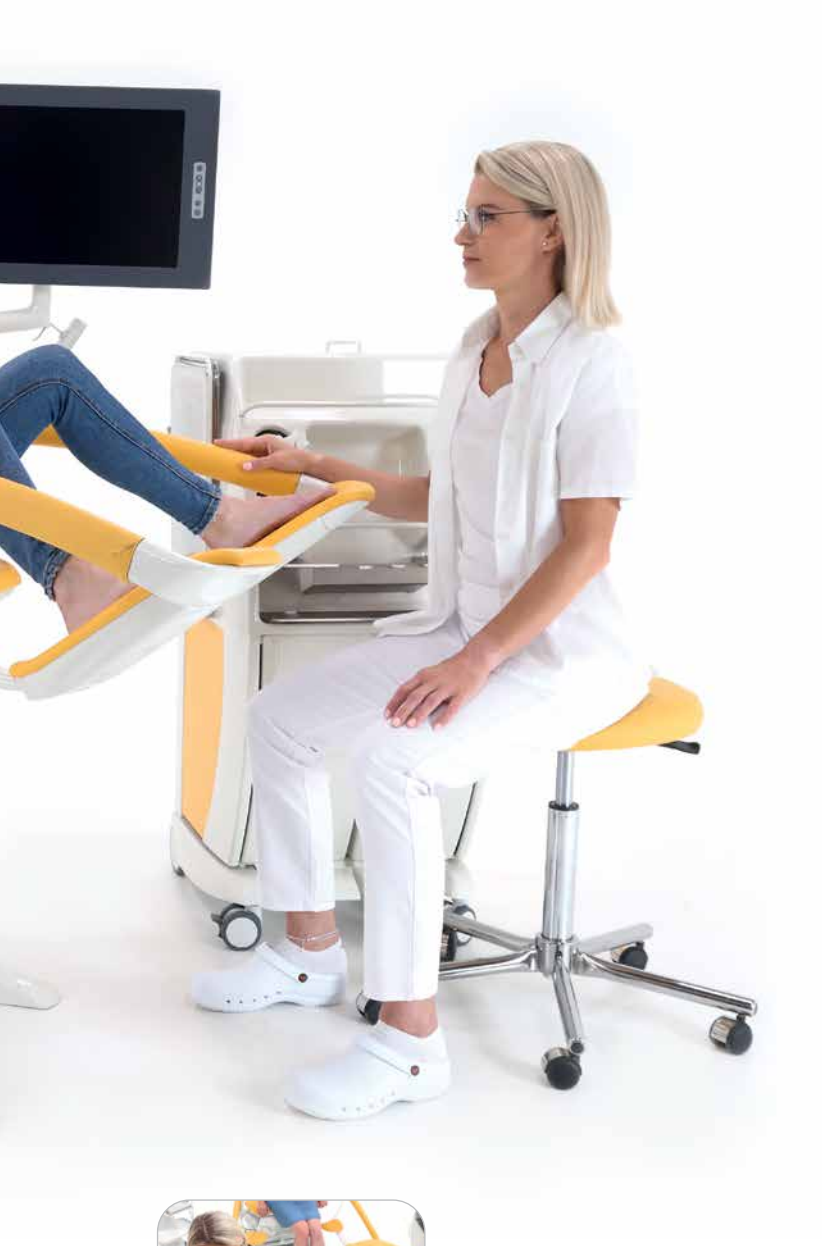
FULL HD LCD and wireless transfer of photos and videos to the doctor's PC.